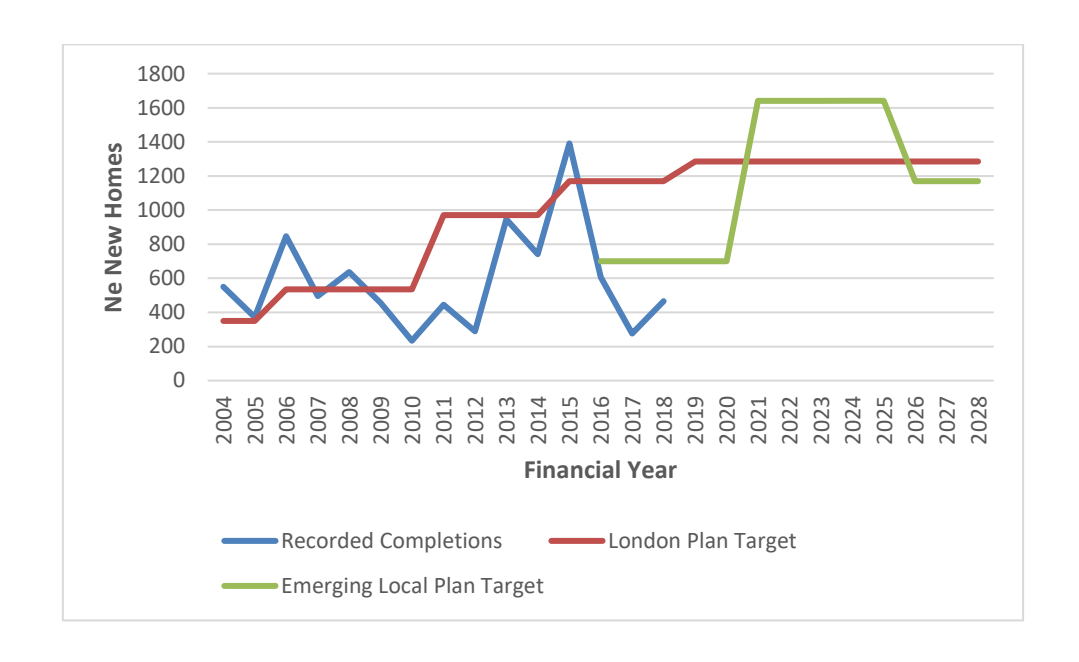
Figure 3: Anticipated Housing Completions against Target Completions