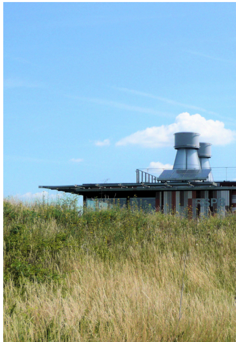
RSPB Environment and Education Centre, Van Heyningen & Haward Architects