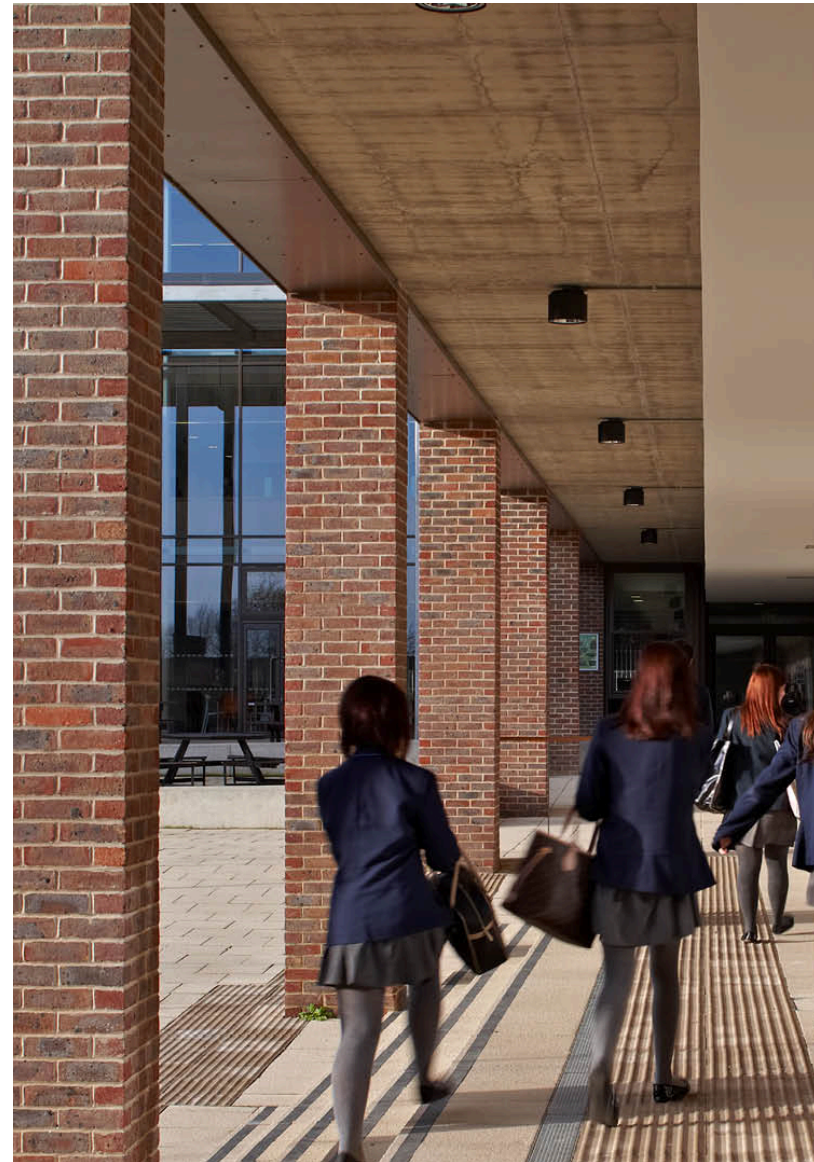
Drapers' Academy, Fielden Clegg Bradley Studios, RIBA National Award 2014 / RIBA London Award 2014

Where a scheme returns for a second or subsequent review, the report of the previous review will be provided with the agenda.