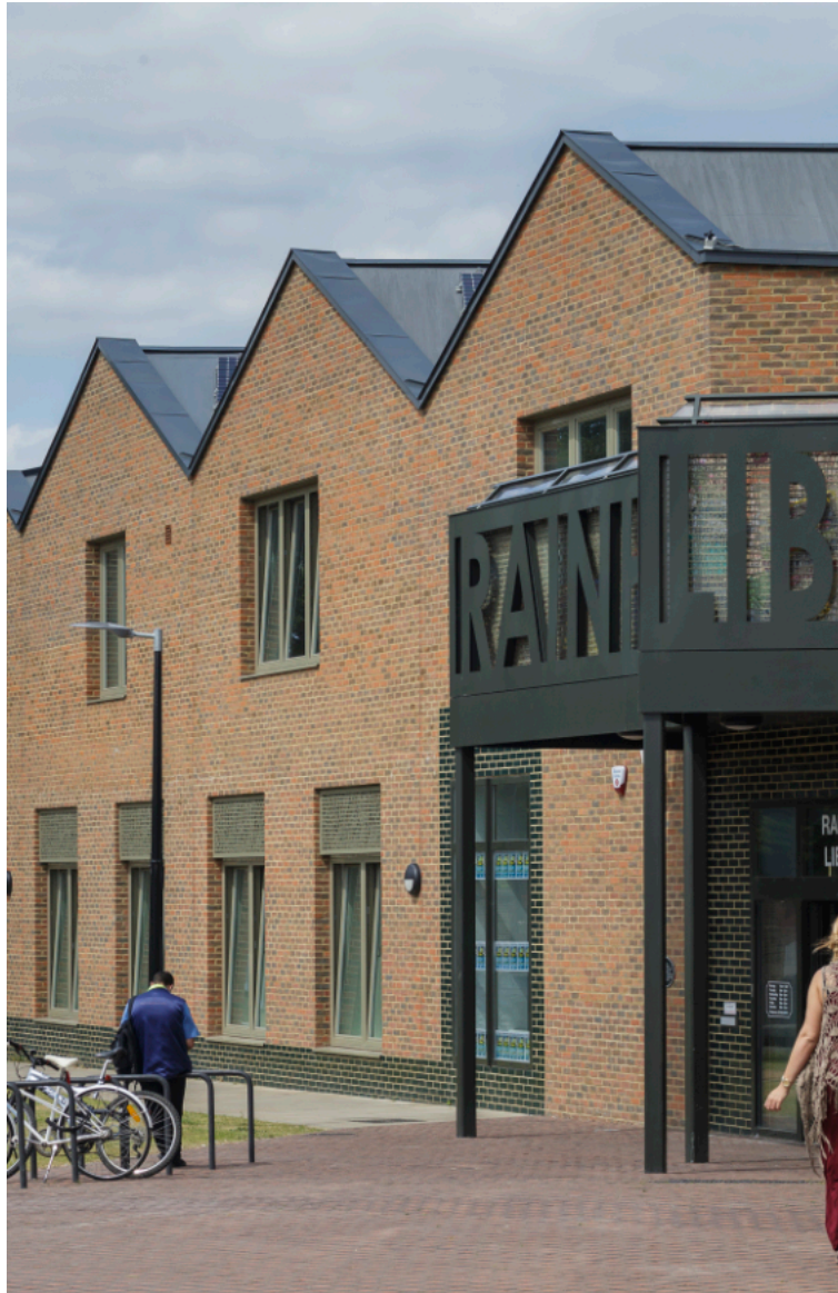
Rainham Library, Maccreanor Lavington Architects