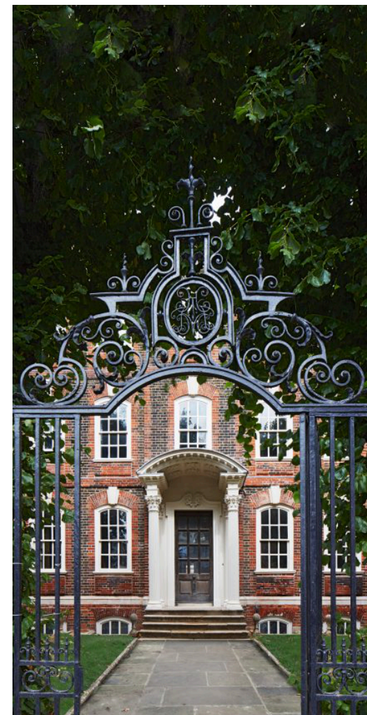
Gate at Rainham Hall © Julian Harrap Architects

www.london.gov.uk/sites/default/files/ggbd_london_design_review_charter_jan22.pdf