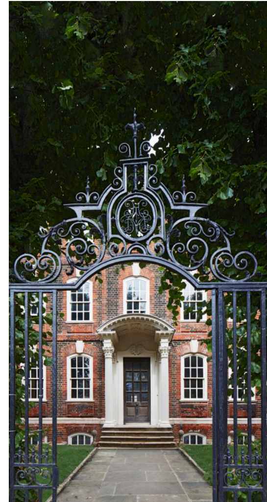
Gate at Rainham Hall © Julian Harrap Architects

www.london.gov.uk/sites/default/files/ggbd_london_design_review_charter_jan22.pdf