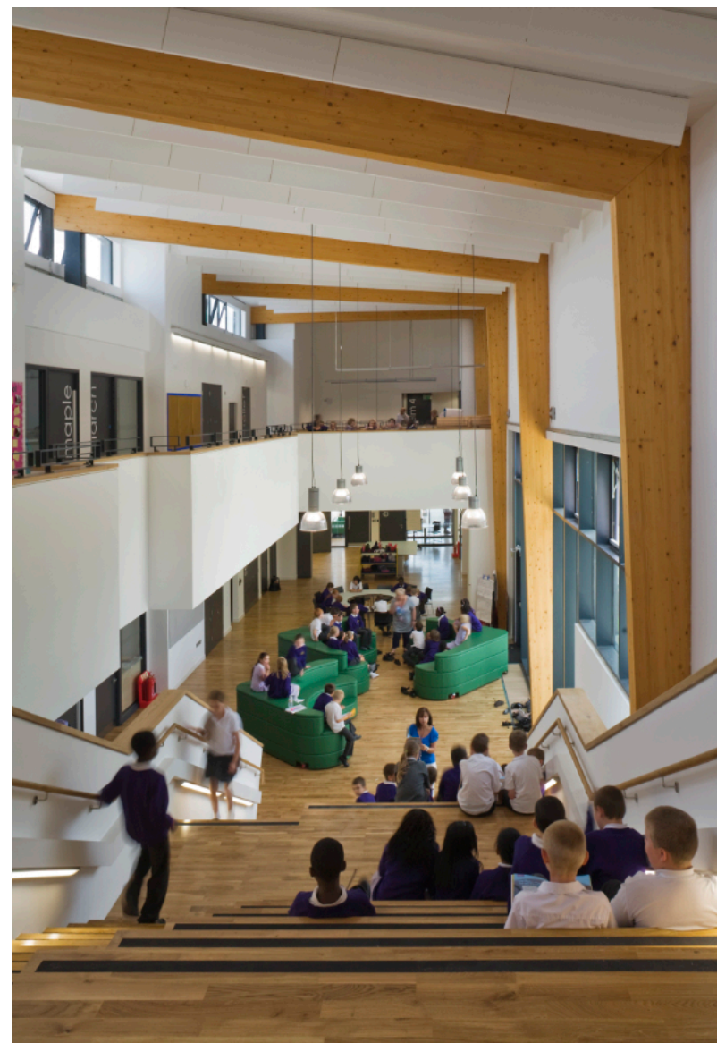
Elm Park Primary School, Walters & Cohen Architects

From time to time, it may be of benefit for specialist advice to be provided beyond the Quality Review Panel membership. In such cases, a professional with the relevant expertise may be invited to attend a review meeting, participating in the discussion with the status of an adviser to the panel.