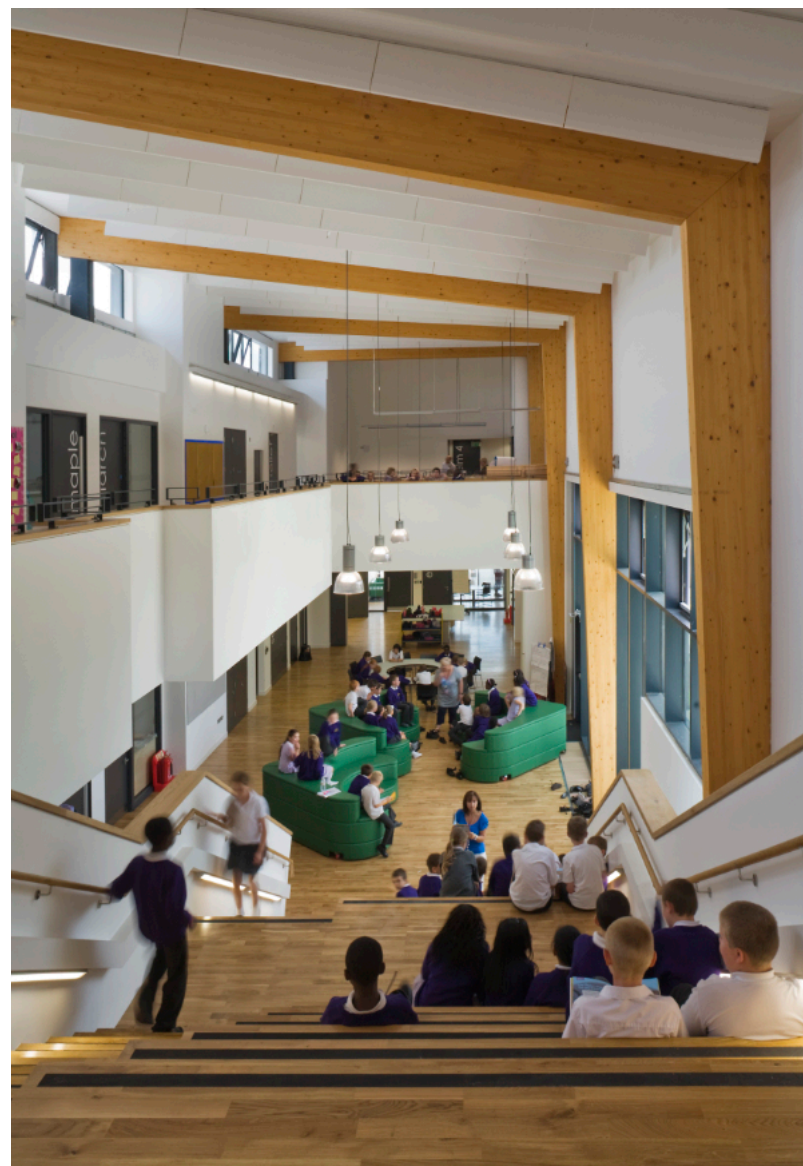
Elm Park Primary School, Walters & Cohen Architects

From time to time, it may be of benefit for specialist advice to be provided beyond the Quality Review Panel membership. In such cases, a professional with the relevant expertise may be invited to attend a review meeting, participating in the discussion with the status of an adviser to the panel.