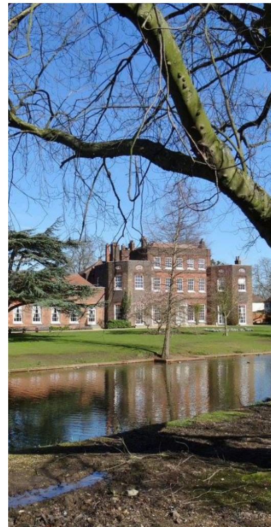
Langtons Gardens, Hornchurch

As part of this annual review process, a meeting will be held with the planning authority and the panel chair to discuss the report and consider any recommendations for the following year.