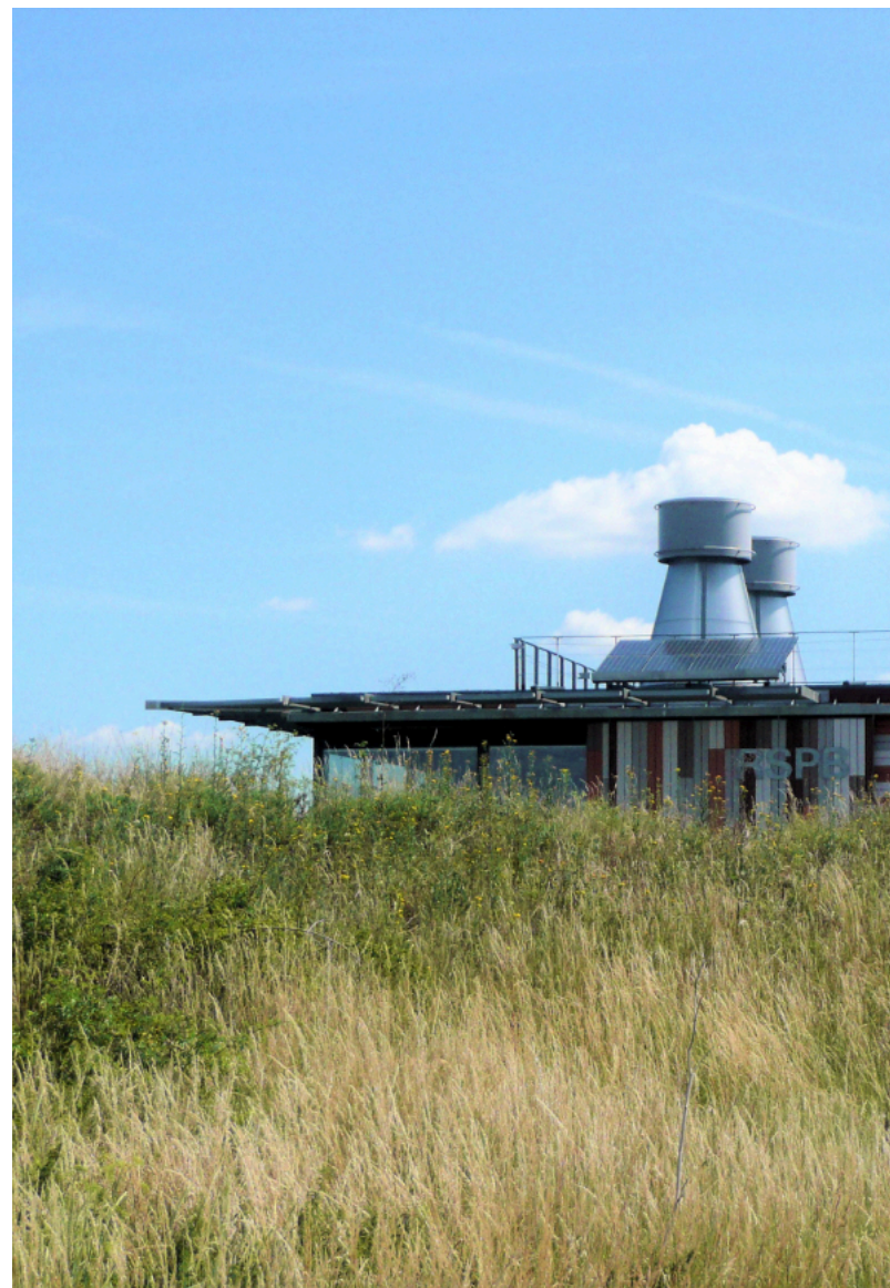
RSPB Environment and Education Centre, Van Heyningen & Haward Architects