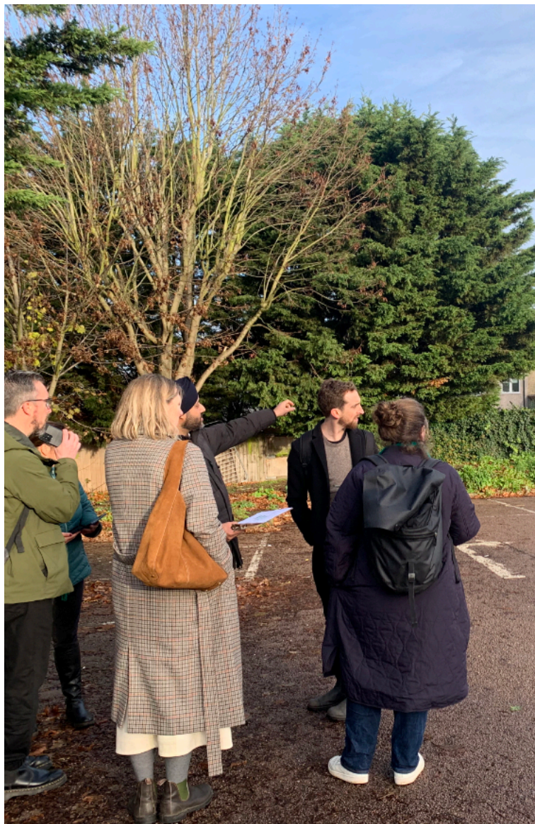
Havering Quality Review Panel site visit