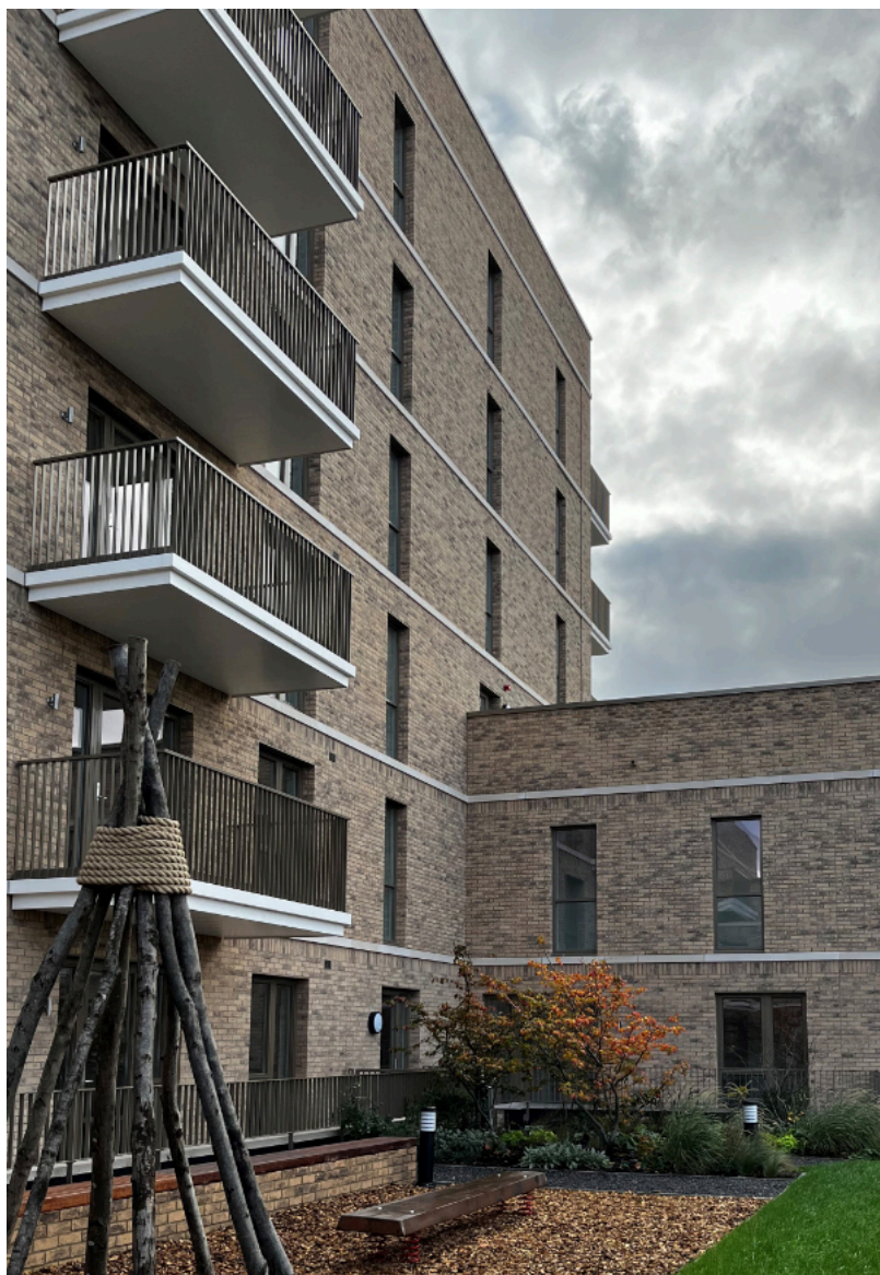
Napier New Plymouth, JTP