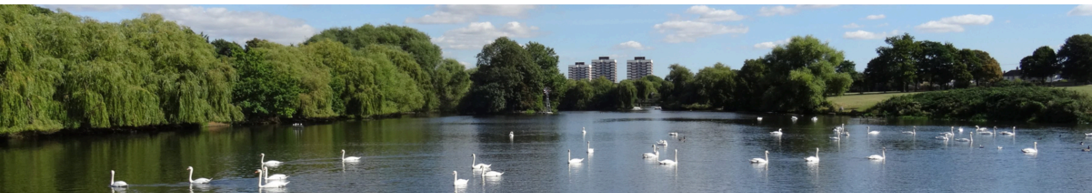
Harrow Lodge Park

Design Review: Principles and Practice Design Council CABE / Landscape Institute / RTPI / RIBA (2013)