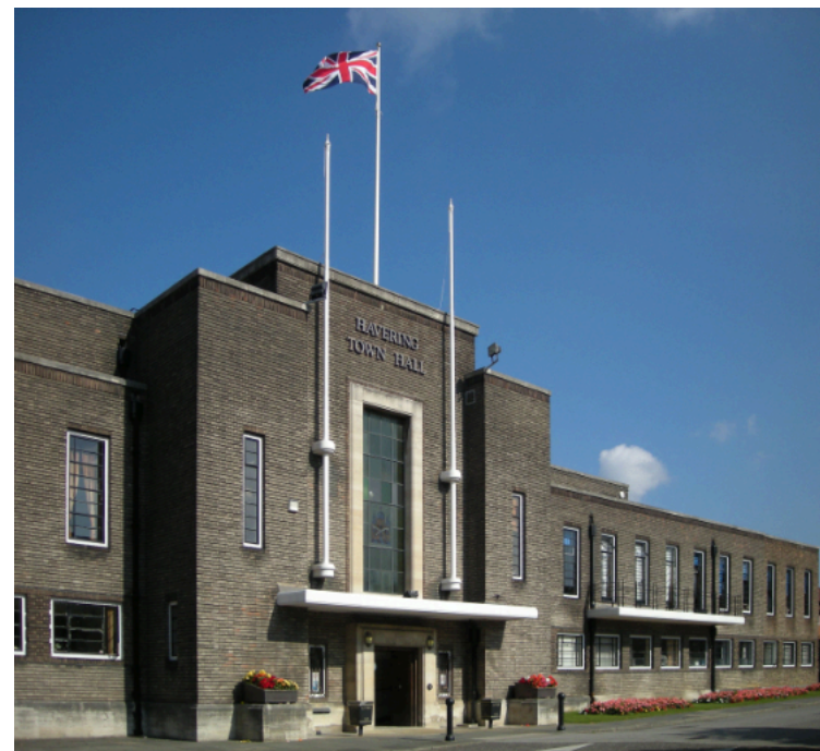
Havering Town Hall

As a public authority, the London Borough of Havering is subject to the Freedom of Information Act 2000 (the Act). All requests made to Havering Council for information with regard to the Quality Review Panel will be handled according to the provisions of the Act. Legal advice may be required on a case by case basis to establish whether any exemptions apply under the Act.