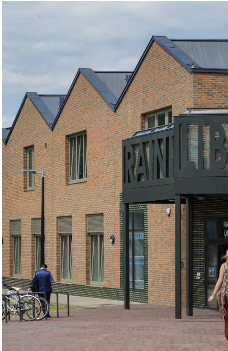
Rainham Library, Maccreanor Lavington Architects