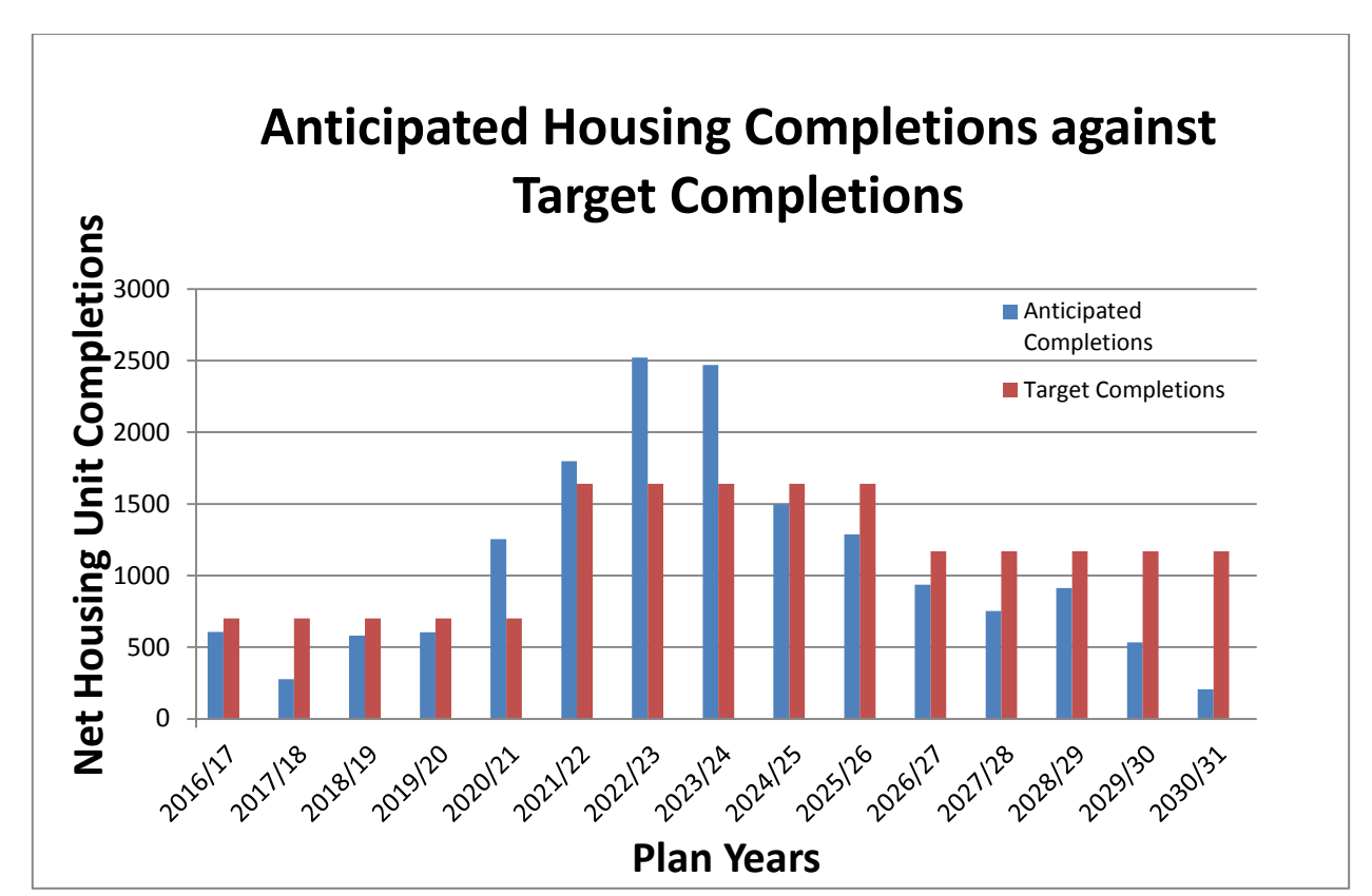
Table 5.2: Anticipated housing completions compared with target completions