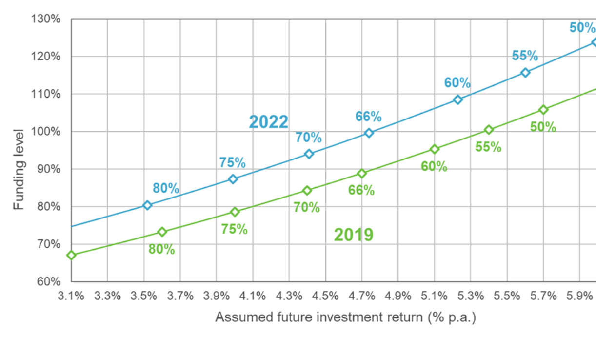
Chart 2: funding level across a range of future investment returns

Figures on each line show the likelihood of the Fund's assets exceeding that level of return over the next 20 years