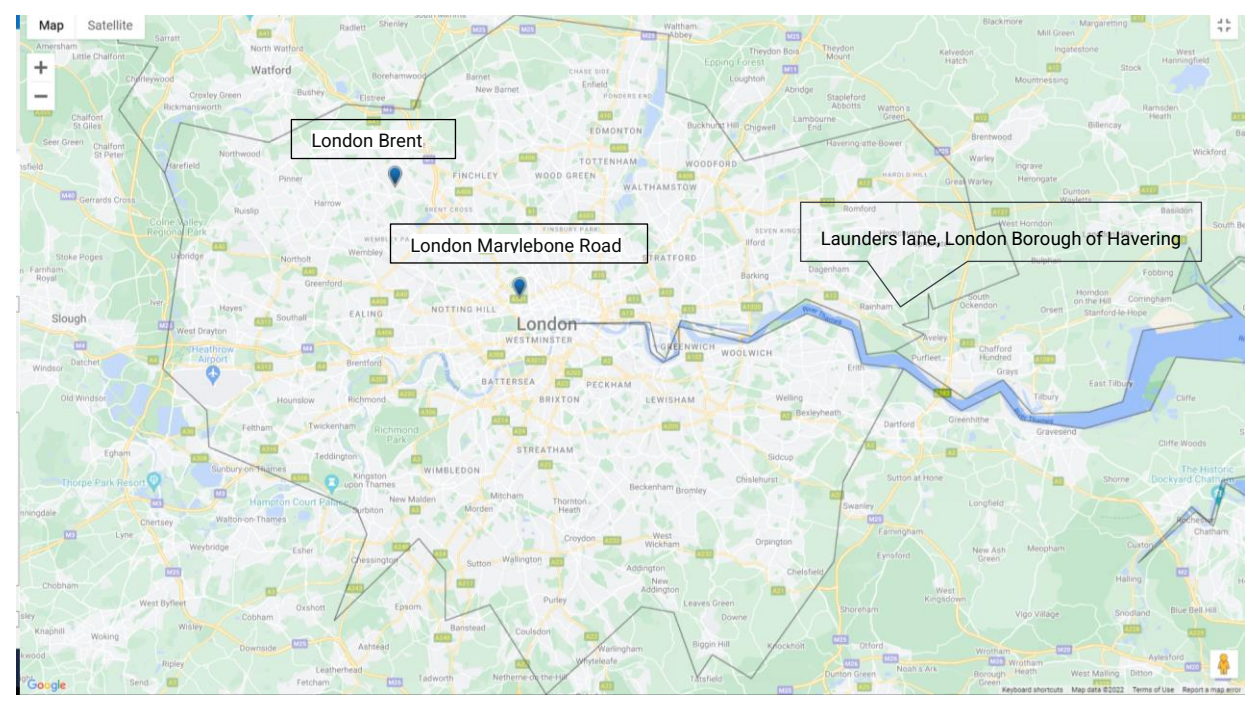
Figure 1 Defra PAH Network & site location

Following discussion with the client we can compare PAH data with data collected by Defra PAH Network<sup>18</sup> (Figure 1) in London.