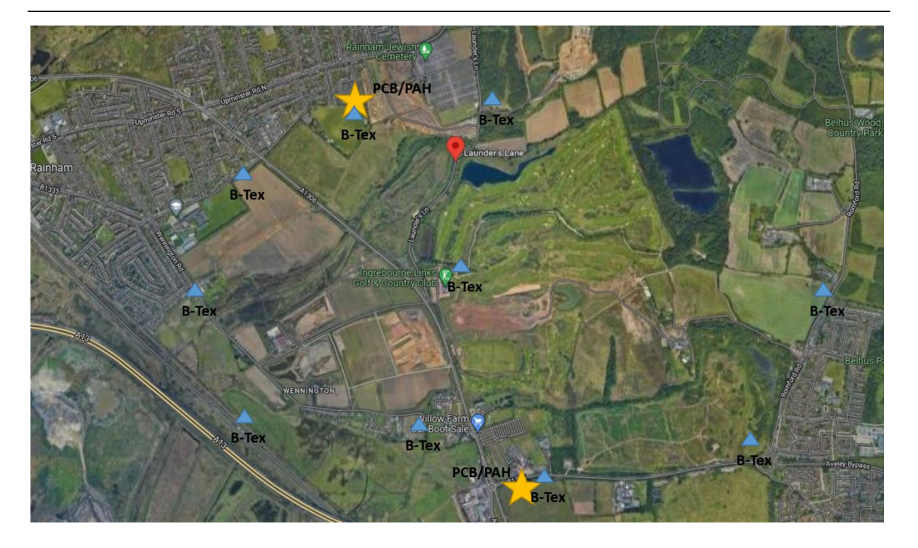
Figure 1 Map of proposed monitoring locations