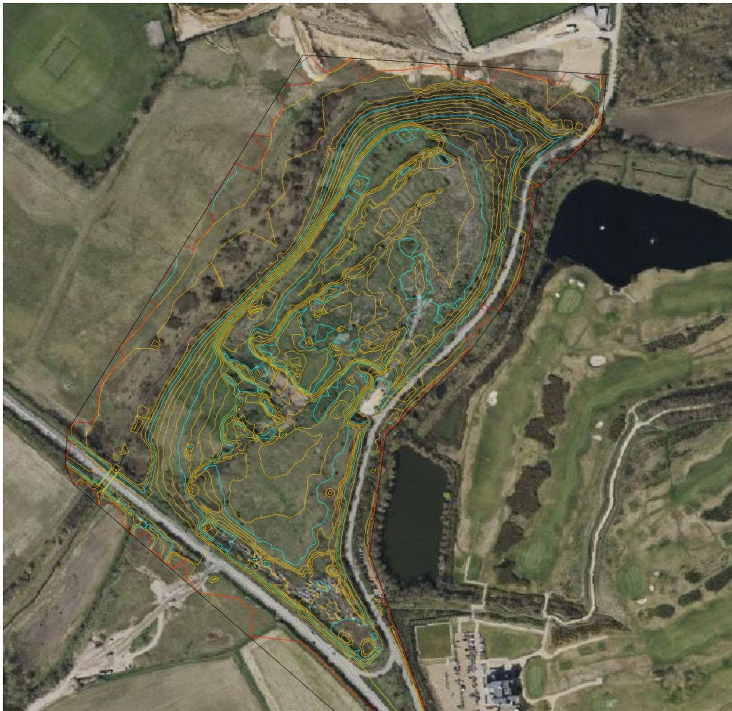
Figure 2: Approximate topography of site, excluding bunds and ditches

The current levels across the site based on spot heights are presented in Figure 2, however, there are a significant number of steep sided ditches and bunds.