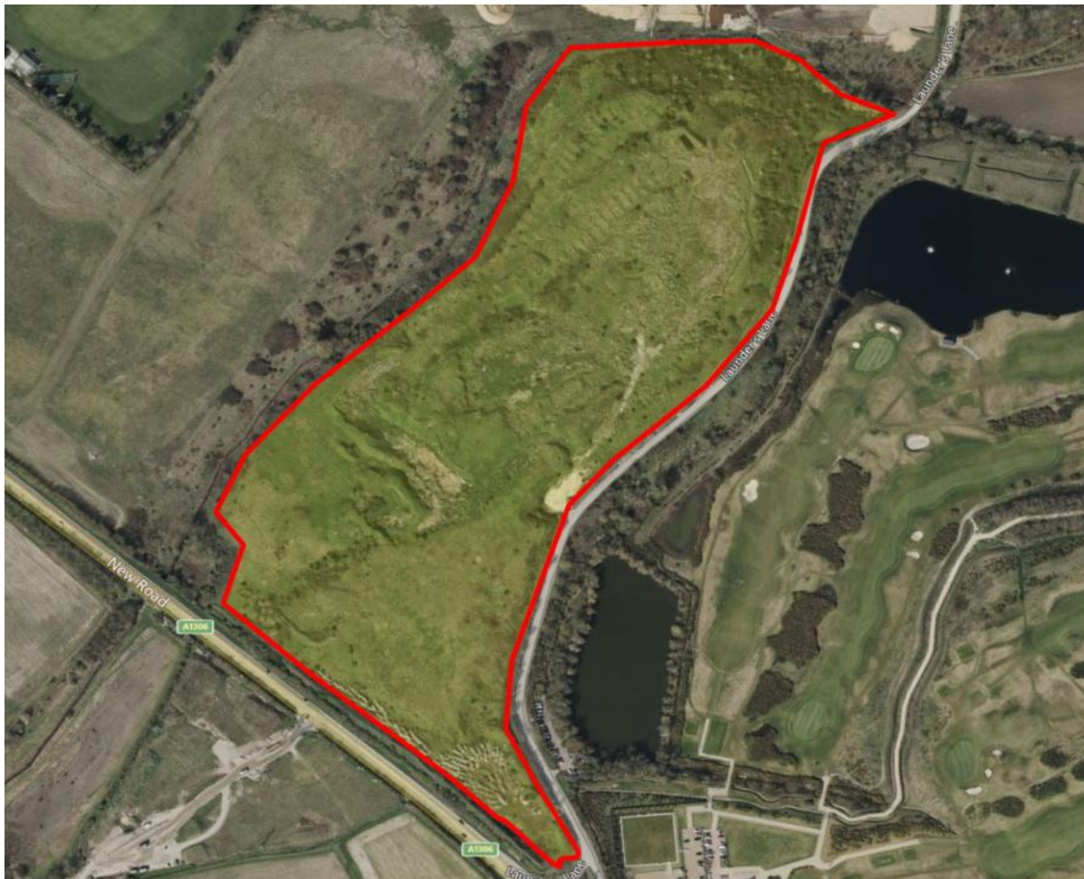
Figure 1: Site location and layout

The site location and layout are presented in Figure 1, below. It is an irregular polygon of approximately 17 hectares, centred around National Grid Reference 554116 182008. It is bounded to the north and west by a watercourse (Common Watercourse), and to the south and east by roads (A1306 and Launder's Lane respectively).